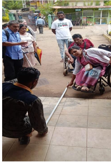
Nuwara- Eliya District