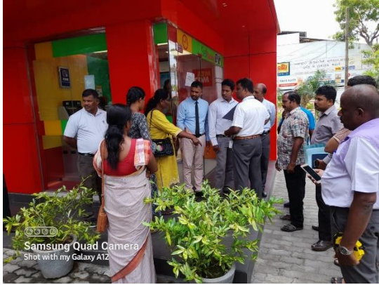
Audit in Kalmunai