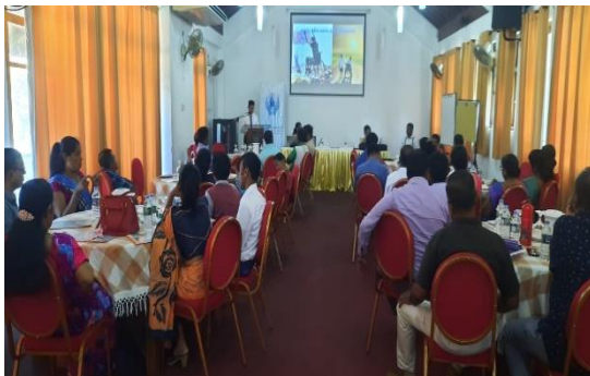
North Central Province